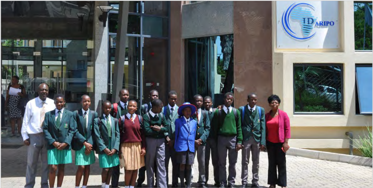
Students arrival at ARIPO Headquarters.