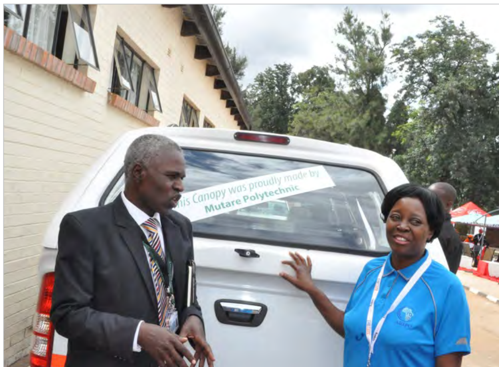
A lecturer from Mutare Polytechnic proudly displays a car canopy the college is manufacturing on behalf of a local car assembly.