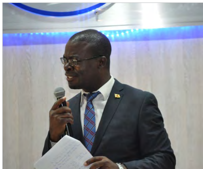
Minister Professor Amon Murwira.

“Inventions must also be protected using intellectual property rights.”