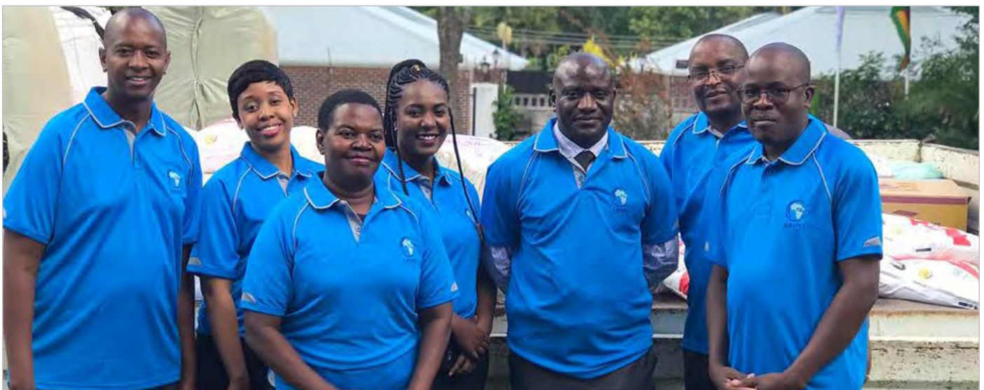
Some of the ARIPO members of staff who accompanied the donation.