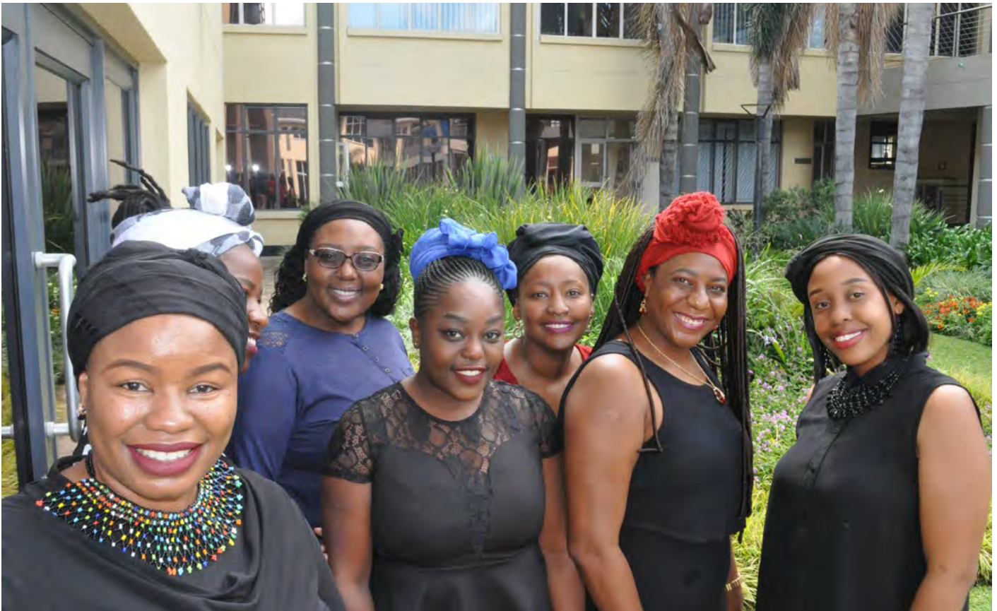
A group of some of the ARIPO female members of staff.