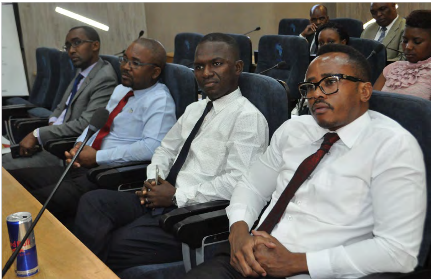
A group of some of the ARIPO male members of staff.

“Everyone has a right to equal access to employment”