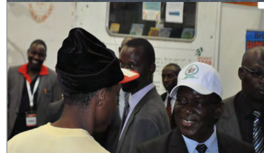
TOP PICTURE: A NUST student demonstrates a head motion controlled wheel chair for use by stroke patients and paralympians.